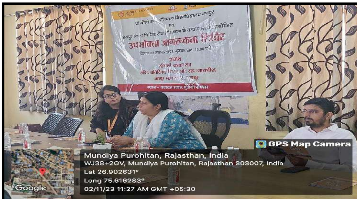
GPS Map Camera Mundiya Purohitan, Rajasthan, India WJ38+2GV, Mundiya Purohitan, Rajasthan 303007, India Lat 26.902631° Long 75.616283° 02/11/23 11:27 AM GMT +05:30