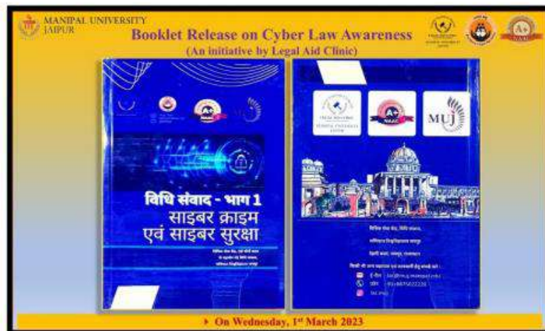
The image shows the legal awareness booklet so disseminated