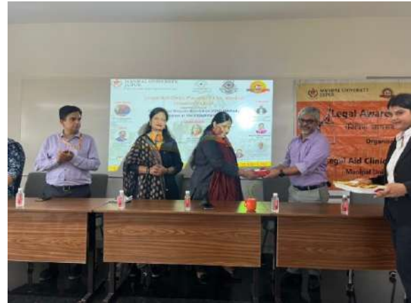
Pictures of Felicitation Ceremony of the Chief Guest by School of Law, MUJ