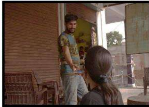
Pictorial representation of the dissemination of Legal Aid Clinic and ProBono Club, Manipal University Jaipur, Legal Awareness Booklets on Cyber Crimes and Cyber Security