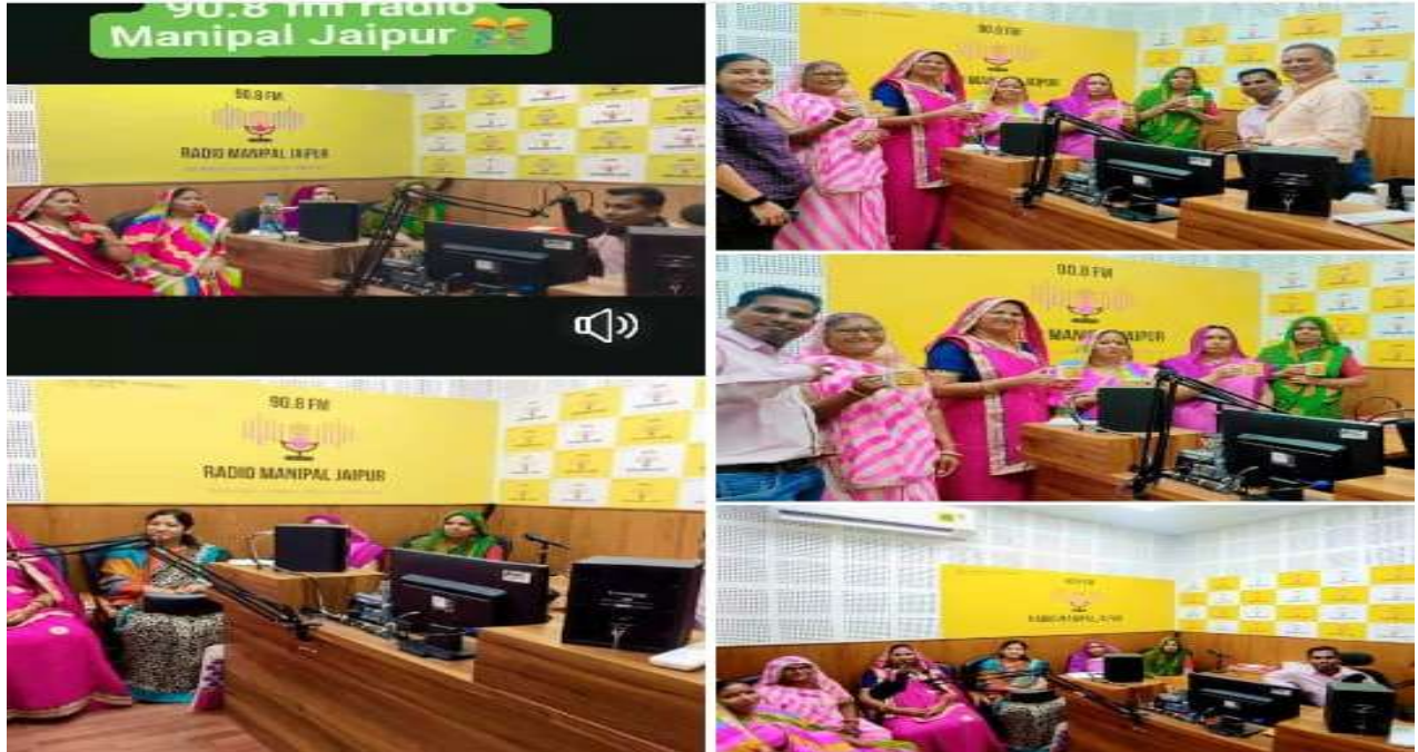
Celebration of Janmashtami