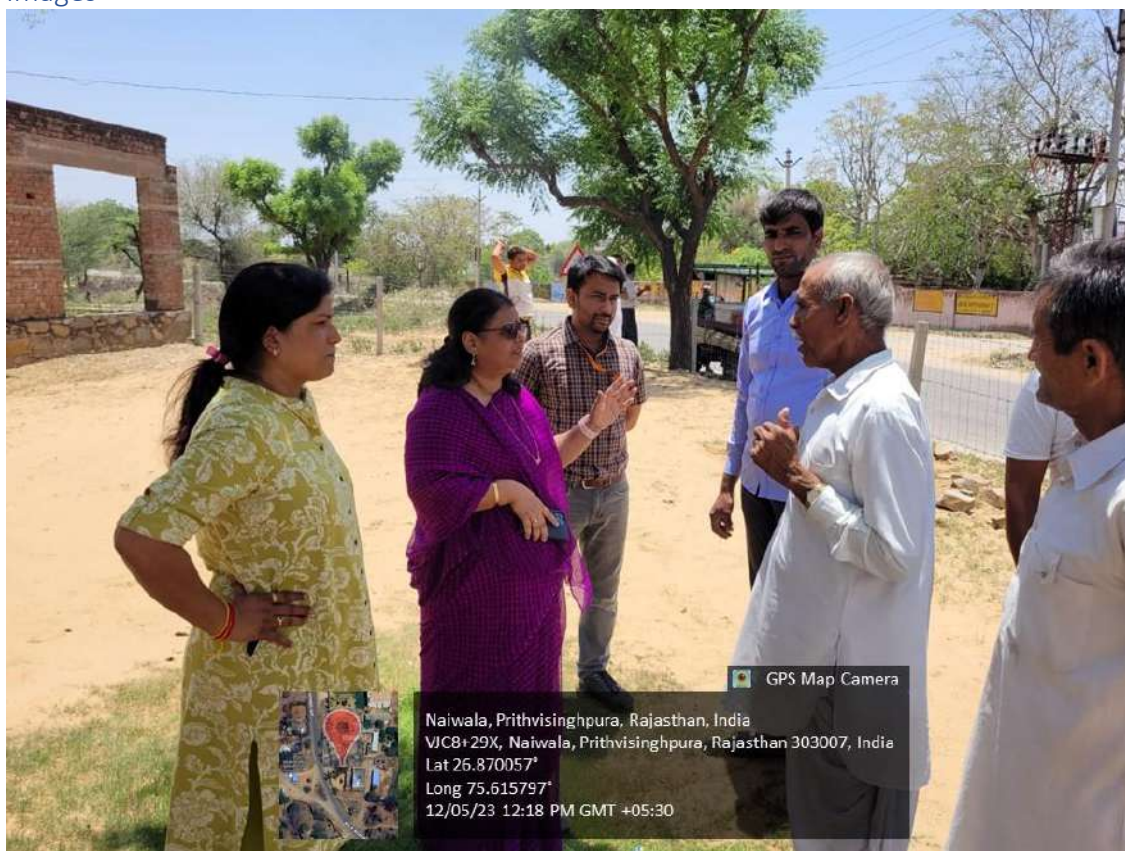
Figure 1: Discussion on Site About Waste Management System