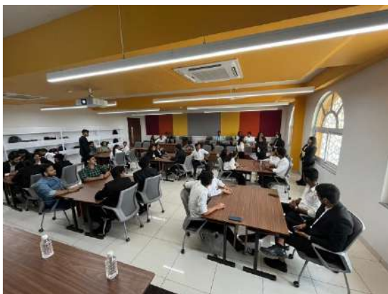
Participation of the students in the event