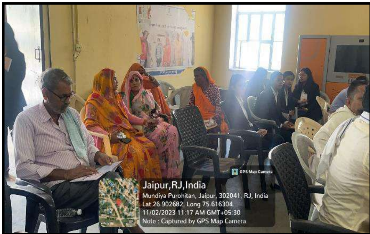
GPS Map Camera Jaipur, RJ, India Mundiya Purohitan, Jaipur, 302041, RJ, India Lat 26.902682, Long 75.616304 11/02/2023 11:17 AM GMT+05:30 Note : Captured by GPS Map Camera