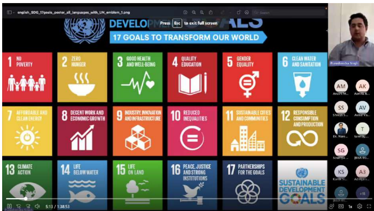
Expert Introducing the Sustainable Goals