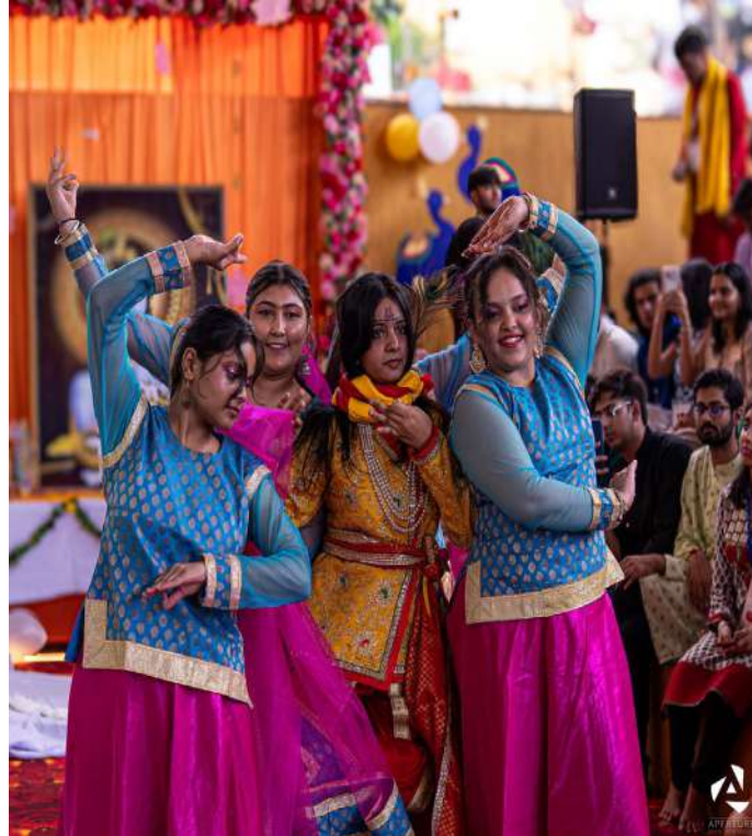
Celebration of Ganesh Chaturthi